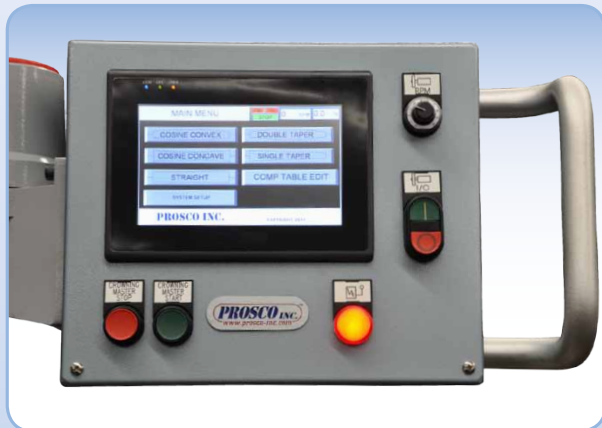
Optional Swing-Arm Mounted Controls