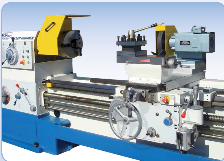
PROSCO Inc. Grinders are Custom Designed for a Perfect Fit on Your Lathe