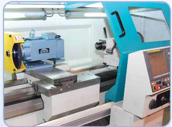
Typical Grinder Installations

Our innovative optional features such as tapered shafts for wheel mounting lower vibrations and improve surface finish. We also offer grinders for grooving as well as other custom applications.