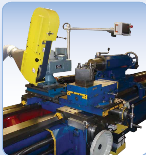
Tilted For Polishing With Slack Belt