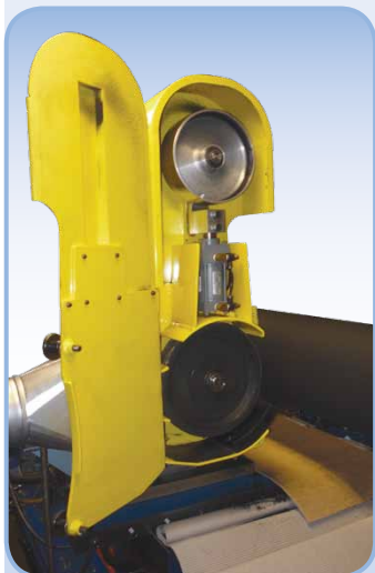
Grinding With Carbide Wheel