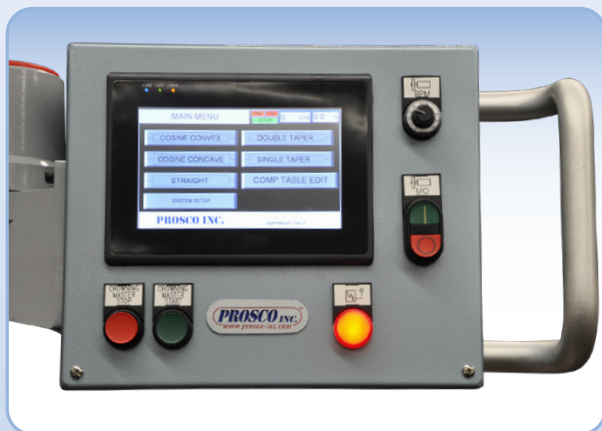
Optional Swing-Arm Mounted Controls